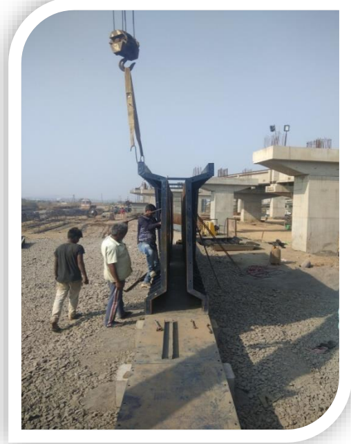
Client: J. Kumar Infraprojects Ltd.