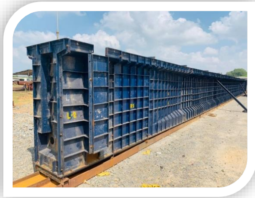
Project: NHAI, Thanjavur District, Tamil Nadu