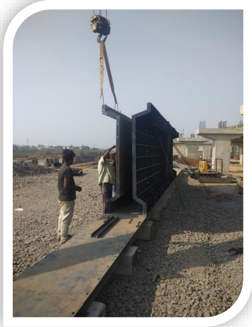
Project: NHAI, JNPT, Navi Mumbai