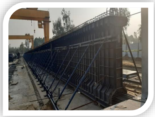
Client: Patel Infrastructure Ltd.